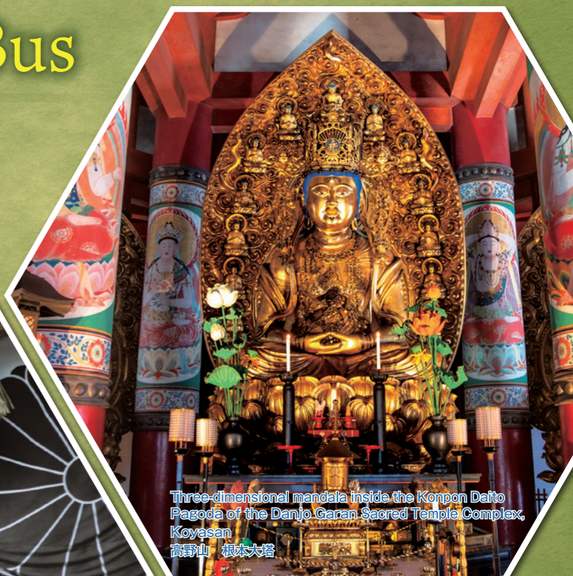
Three-dimensional mandala inside the Konpon Daito Pagoda of the Danjo Garan Sacred Temple Complex, Koyasan