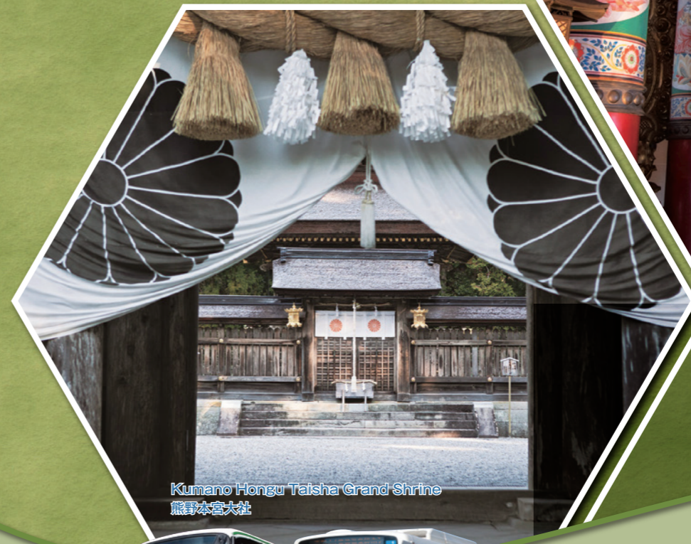
Kumano Hongu Taisha Grand Shrine